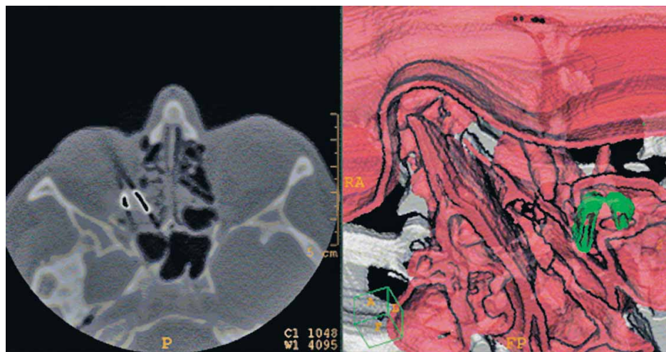
Fig. 3. An example of 3D computer-assisted surgery of the nose and paranasal sinuses (3D-C-FESS) with simulation and planning of the course of operation.

Tele-operation is a special case of tele-presence where in addition to the illusion of presence at a remote location the operator also has the ability to perform certain actions or manipulations at the remote site. In this way, it is possible to perform various actions at distance locations, where it is not possible to go due to danger, prohib-