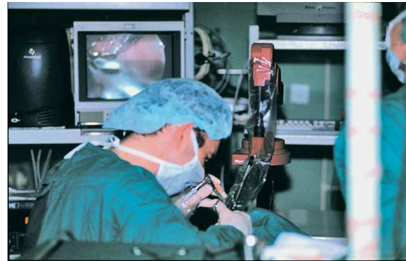
Fig. 2. Virtual endoscopy and tele-virtual endoscopy overcomes some difficulties of conventional endoscopy. In classical endoscopy an endoscope is inserted into the patient to examine the internal organs or spaces. The physician uses an optical system to view interior of the body.

as the user moves, so that up-to-date visualization is always shown on the computer screen 6 (Figure 2). Such a preoperative preparation can be applied in a variety of program systems that can be transmitted to distant collaborating radiological and surgical work sites for preoperative consultation as well as during the operative procedure in real time 6 .