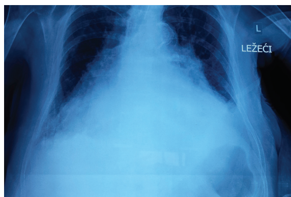
Figure 3. Control chest X-ray after interval of 6 hours from admission in ICU.

After that patient was taken to operation theatre and positioned supine. During the treatment patient had a fall of heart rate to 50/min and atropine 0.5mg was adminis-