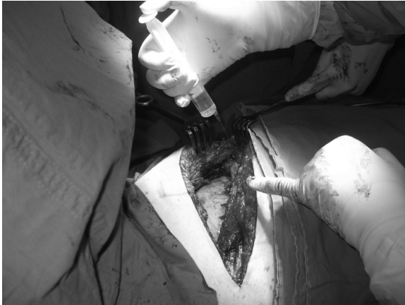
Figure 1. Intraoperative intercostal block. Intercostal nerve in the thoracotomy wound and nerves below and above thoracotomy wound were infiltrated using 5 mL bupivacaine 0.5% per intercostal space.

12). Such early suppression of pain stimuli effectively reduces an occurrence of acute postoperative pain (12) and significantly reduces postoperative analgesic drug consumption (13, 14).