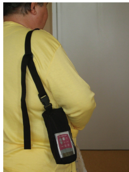
Figure 3. A breast cancer patient after quadreantectomy with axillary lymph node dissection carrying PCA pump delivering local anaesthetic levobupivacaine. PCA pump allows dose adjustment which is usually required in the obese or underweight patients.

In the several studies continuous wound infiltration was efficient for the postoperative analgesia in the breast