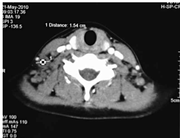
Fig. 1. Computed tomographic (CT) scan revealed a 15 mm mass in the right lower jugular node (level IV) with peripheral enhancement.

Nasal and oral examinations were unremarkable. Blood analysis at admission time presented with slight anaemia. White blood cell count was 5.0 \times 10^9/L (reference range 4.4\text{--}11.6 \times 10^9 ) and consisted of 76% neutrophils, 10% monocytes, 13% lymphocytes, less than 1% basophils, and less than 1% eosinophils. Her haemoglobin level was 111 g/L, (reference range 118–149 g/L), and her platelet count was 272 \times 10^9/L (reference range 178\text{--}420 \times 10^9/L ). A computed tomographic (CT) scan revealed a 15 mm mass in the right lower jugular node (level IV) with peripheral enhancement (Figure 1). Adjacent lymph nodes along the right jugular chain were also enlarged. The patient underwent an excisional biopsy. During surgery, a solid mass was identified and removed. Histopathological analysis of extracted specimen revealed necrotizing changes with abundant karyorrhectic debris, scattered fibrin deposits and a collection of large mononuclear cells (Figure 2). No active treatment was initiated and the patient was discharged home after seven days of in-patient stay. At follow-up she reported no symptoms, remained well and there were no abnormalities found at clinical examination.