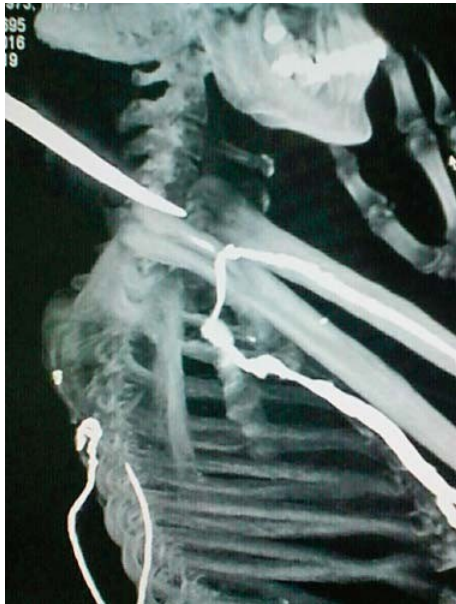
Fig. 1. Upon admission, the patient underwent radiographic scanning, which revealed the trajectory of the knife.

the intervertebral ligaments of C IV/C V in direction to the contralateral common carotid artery, vertebral artery and cervical nerve roots (Figs. 2 and 3). According to radiographs, the patient underwent an urgent surgery. The second penetrating wound inflicted by knife was located in the left-sided supraclavicular region. Postoperatively, the patient had reduced muscle strength of the deltoid muscle (2/5) and reduced muscle strength of the triceps muscle (4/5). Muscle strength of other